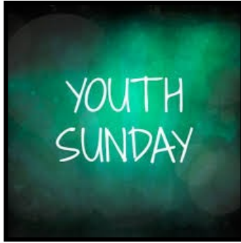
On Sunday, March 5th, the ACC Youth served during the 10:15am service. They designed the bulletin, baked bread, and also served communion. They did a wonderful job!