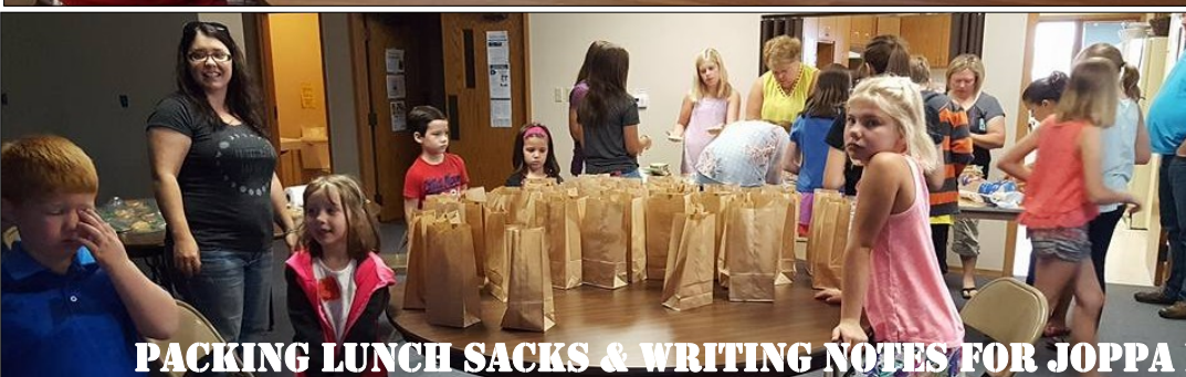
PACKING LUNCH SACKS & WRITING NOTES FOR JOPPA MINISTRIES!